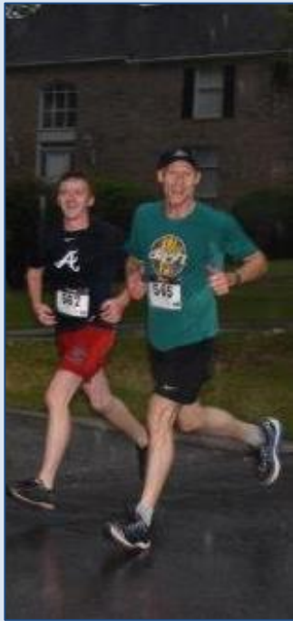
All smiles on the course

The skies opened with downpours just as our 5 th annual Sombbrero Dash started. Yet, a number of local runners braved the rain and wet pavement to complete either the 5K or the 10K race. A number of volunteers also were on hand to register runners, work the start and finish line, direct runners on the course, and much more. Thanks to our sponsors who helped to make this annual event happen and whose contributions will add to our Community Project Fund.