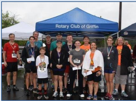
Happy (and wet) medalists at awards ceremony