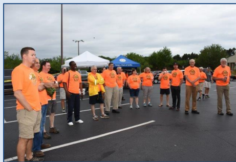
Thanks to our volunteers.