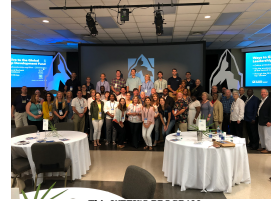
This WEEK'S PROGRAM

Thirteen Rotarians enjoyed a two day summit at First Presbyterian last Thursday and Friday to become better leaders.