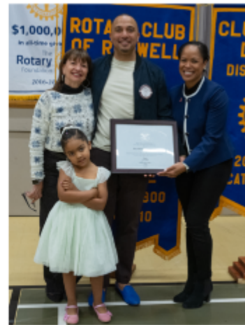
Frederick Levy Award for Hours of Service