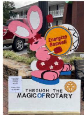
After Hours Club Roswell Rotary Club