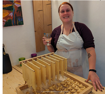
Thursday, Sept. 5