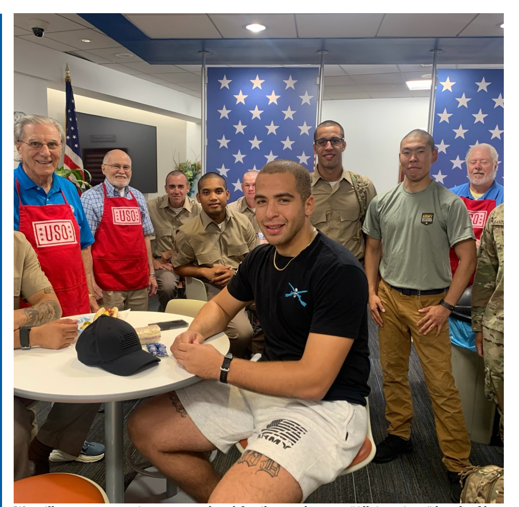
We will serve our service personnel and family members an "All American" lunch of hot dogs with all the condiments, potato chips, fresh fruit, snack bars, home baked cookies bottled water plus a portion of baked Ziti & Mom's meatballs.

We would like to have a total of eight volunteers for the day from 9 AM to 3 PM. Duties vary from greeter, cookie packer, hot dog grill mate, server, bag monitor among other to do items that need to be done to serve our military service personnel.